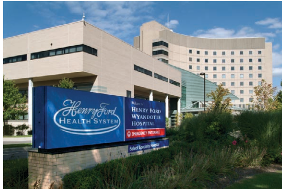
Henry Ford Wyandotte Hospital

First, rigorous tracking of deviations has resulted in improved specimen labeling, particularly in HFHS clinics, D'Angelo says. "For patient safety, that is definitely a benefit, to have real-time information on deviation. That way we can go to the clinic and say, 'Hey, we received six of your specimens today that were unlabeled,' instead of going back to them a month later (with that information), like we used to."