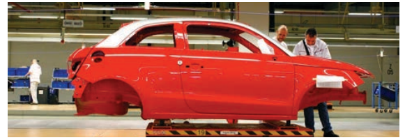
Many quality improvement professionals from the automotive industry reinvented themselves in the health care industry through the Henry Ford Health System.