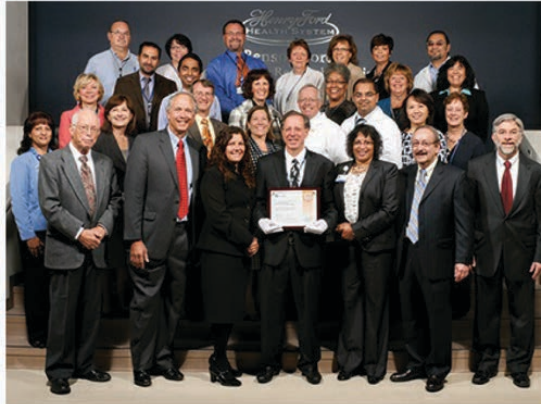
A systemwide HFHS team led the 36 laboratory sites and 800 laboratory employees on its 15189 journey.