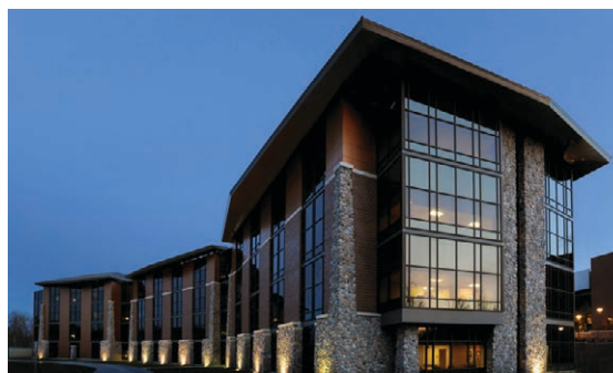
Henry Ford West Blomfield Hospital

By his reckoning, HFHS is not only the largest entity to become ISO 15189 accredited, it's the "only integrated delivery system, where all laboratories are standardized under one source of