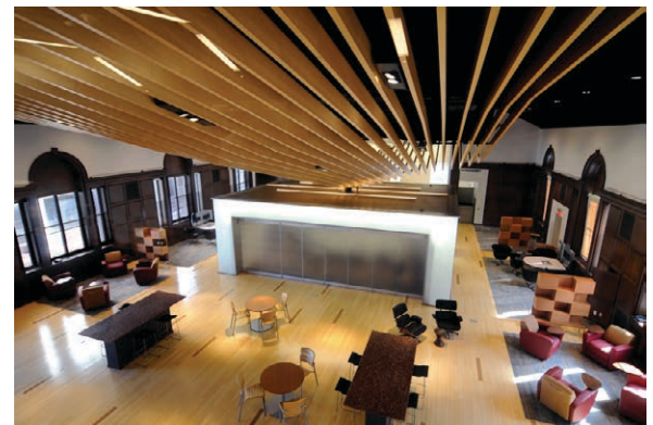
Henry Ford Innovation Institute

She says with satisfaction, "You review progress with them, constantly making sure that everybody's following through. And at the end of six months, your gaps are closed."